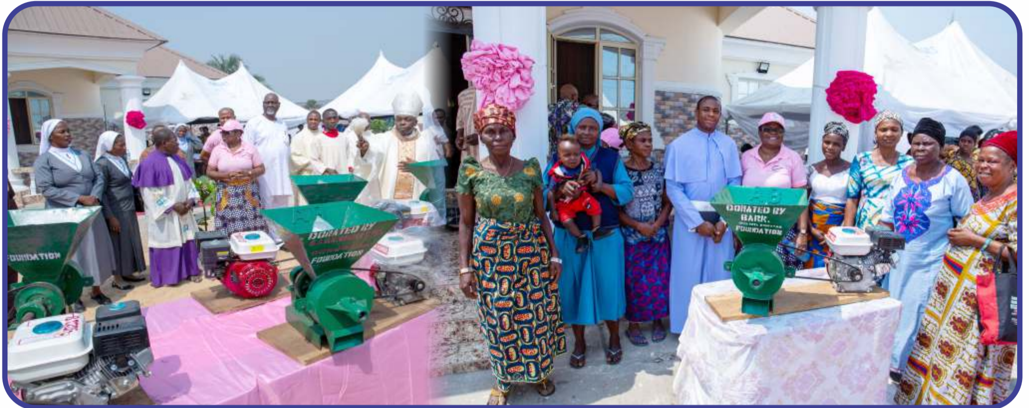
PRESENTATION OF GRINDING MACHINES TO WIDOWS SELECTED FROM VARIOUS COMMUNITIES IN OGBARU L.G.A OF ANAMBRA STATE (FEBRUARY 8, 2020)