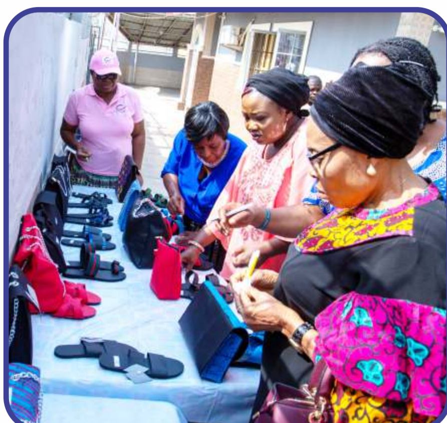
CROSS SECTION OF GUESTS ADMIRING SHOES AND BAGS PRODUCED BY PARTICIPANTS AT THE WORKSHOP (ABUJA BATCH 13TH - 27TH JANUARY, 2020)