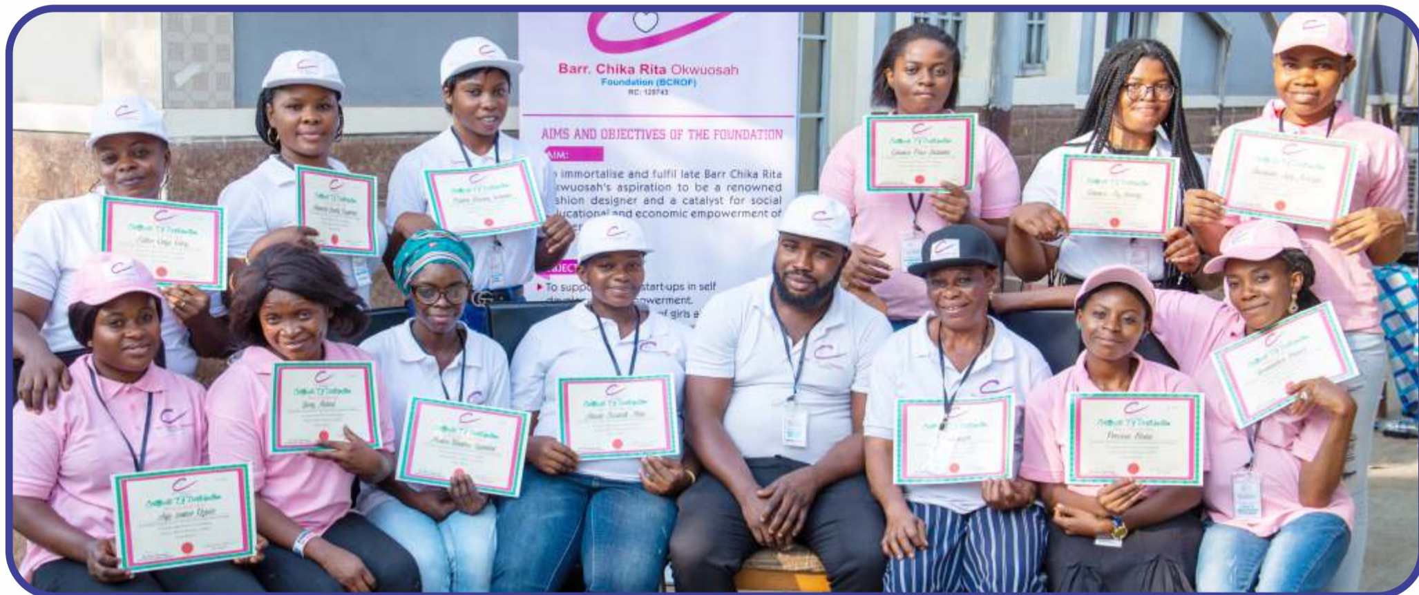
GRADUANDS OF THE 2-WEEK SKILL ACQUISITION ON LEATHER BAGS AND SHOE MAKING FOR GIRLS & WOMEN (ABUJA BATCH 13TH - 27TH JANUARY, 2020)