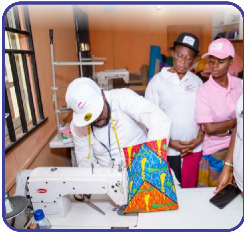
TRAINING SESSIONS AT THE 2-WEEK SKILL ACQUISITION ON LEATHER BAGS AND SHOE MAKING FOR GIRLS & WOMEN (ABUJA BATCH 13TH - 27TH JANUARY, 2020)